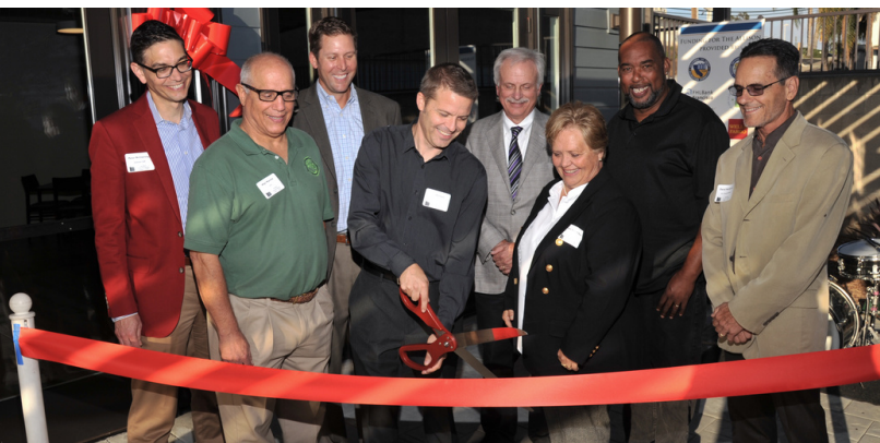
The Allison Apartments Ribbon Ceremony San Diego