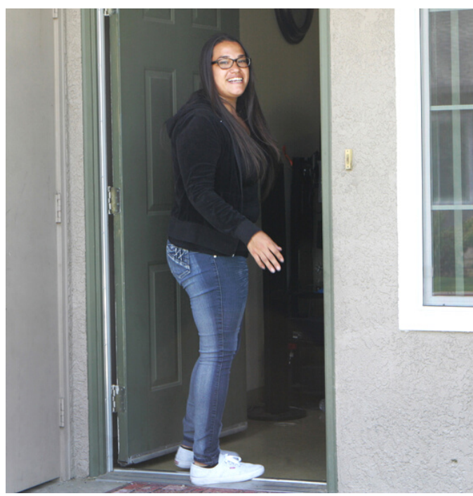
Casas de la Viña Solar Carport Project Madera