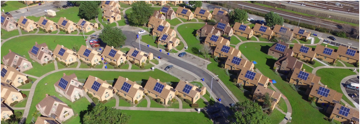
LIWP Triangle Court Project, Richmond, CA